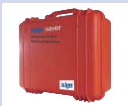
Storage Cabinets (order code:- 355 0424) Wall Mounting Kit (order code:- 355 0431)