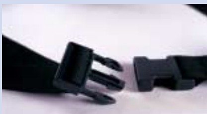
Waistbelt (order code:- 355 0396)