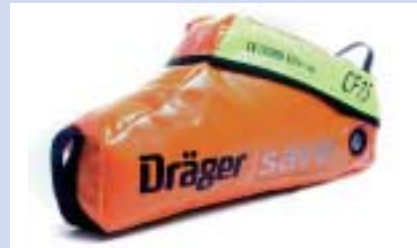
Anti-Static Bag 10min (order code:- 355 0646) Anti-Static Bag 15min (order code:- 355 0647)