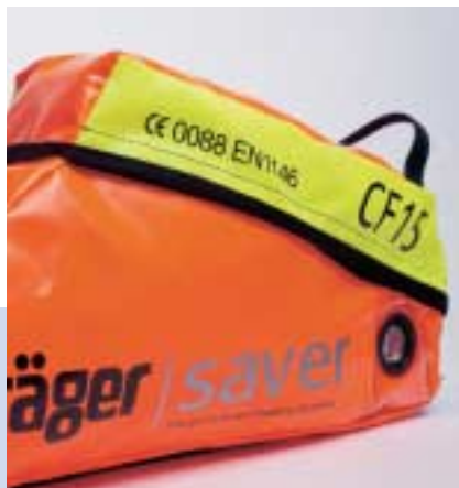
Saver CF15 (order code:- 355 0491)