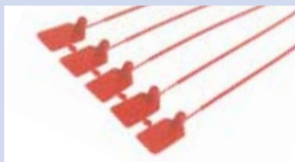
Anti-Tamper Tags (pack of 5) (order code:- 355 0388/K)