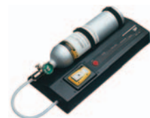
FULL-FUNCTION AUTOMATIC TEST STATION